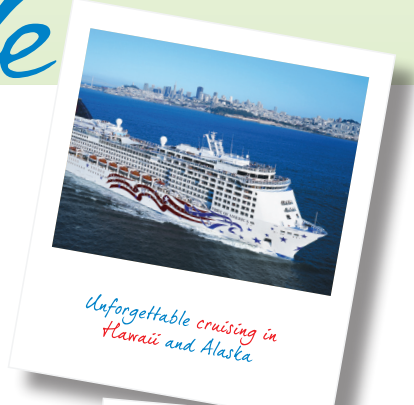
Unforgettable cruising in Hawaii and Alaska