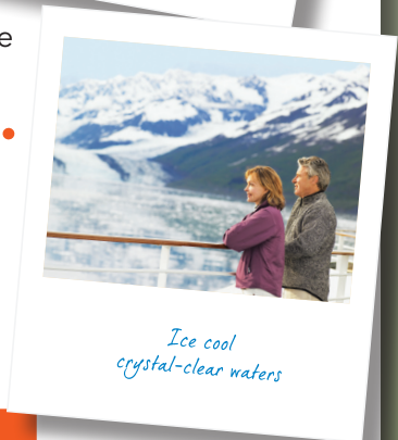
Ice cool crystal-clear waters